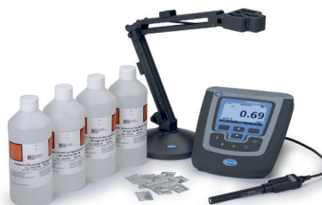
HQD pH Meters & Probes