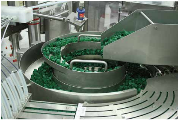
Preparation of the vial caps in the control and sorting drum.