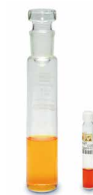
Cuvette tests use 90 % less chemicals than traditional methods.

On top of that the Dosicap system was developed to make adding solid reagents to the vial as simple, as safe and as reproducibly precise as possible. The required amount of reagent is freeze-dried in a vial cap. When the reagent needs to be added the Dosicap is screwed on the vial and the solid reagent is dissolved only after the vial is safely closed again.