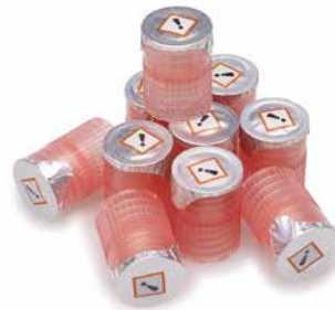
Dosicap Zip allows for exact, non-contact dispensing of freeze-dried reagent.

Continuous environmental stewardship is the other high priority in the development of the TNTplus Vial Tests. The small volumes required for TNTplus tests minimize the amount of chemicals and hazardous substances used.