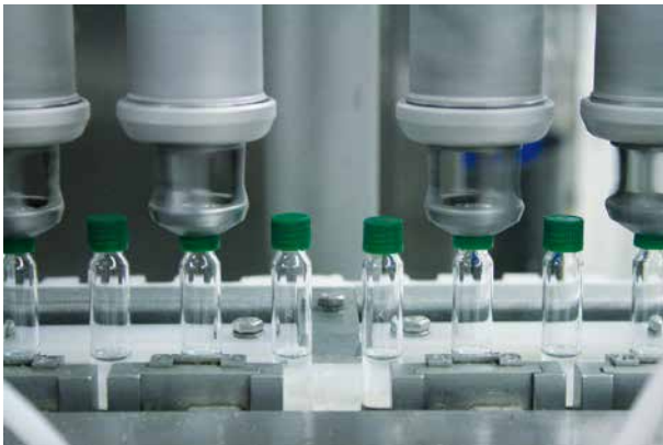
Automatic fastening of the vial caps