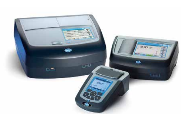
Spectrophotometer range from portable to UV-VIS

Hach supports AQA by offering single and multiparameter standard solutions, test filter sets for photometers and Service Programs for preventive instrument maintenance.