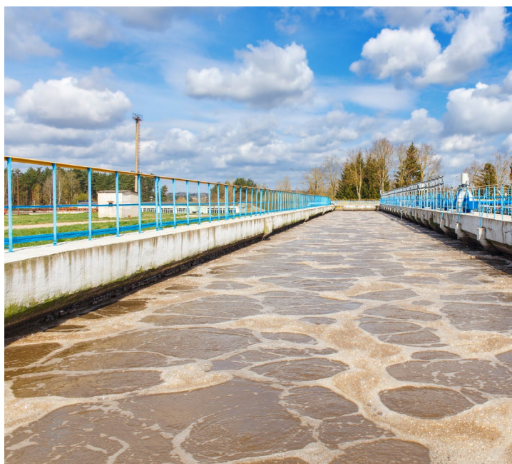
Biological treatment of wastewater

Without adequate nitrogen and phosphorus, bacteria are unable to completely break down complex toxic organic molecules into simpler, less harmful compounds. Even a slight nutrient deficiency can mean that toxic substances are passing through untreated into the final effluent, resulting in higher production costs for post-treatment chemical dosing, or potential fines and downtime resulting from exceeding permit values.