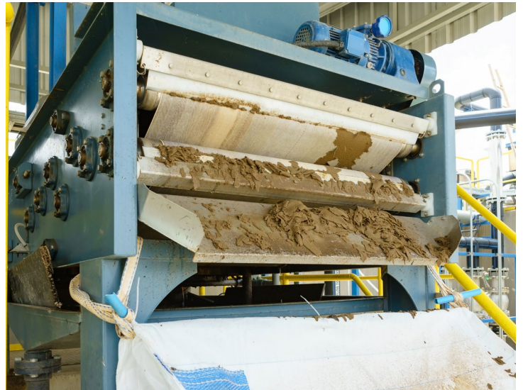
Sludge belt press

Most plants use high-pulp consistency meters to measure suspended solids and control their production. However, these meters are expensive, cannot measure low concentration and are bolted to the pipes without the option to perform maintenance during runtime.